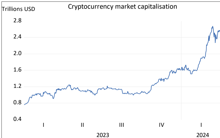
Figure 1. The capitalisation of the cryptocurrency market